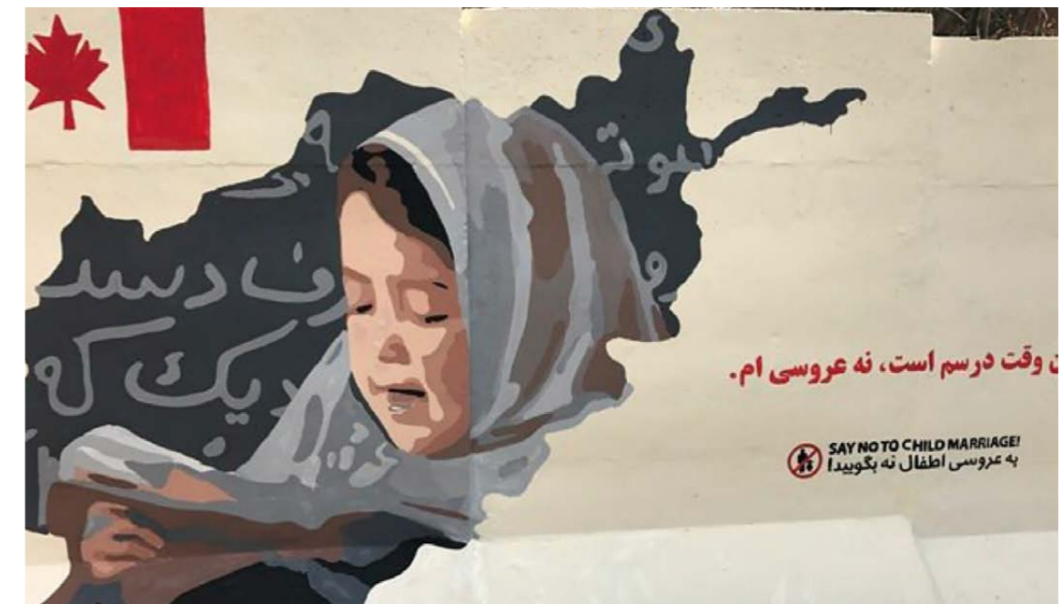
ArtLords, ‘Say No to Child Marriage’, 2016