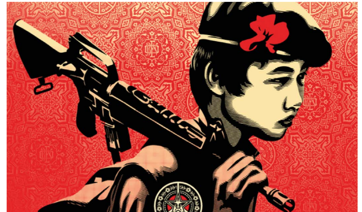
Shepard Fairey, 'Duality of Humanity', 2011