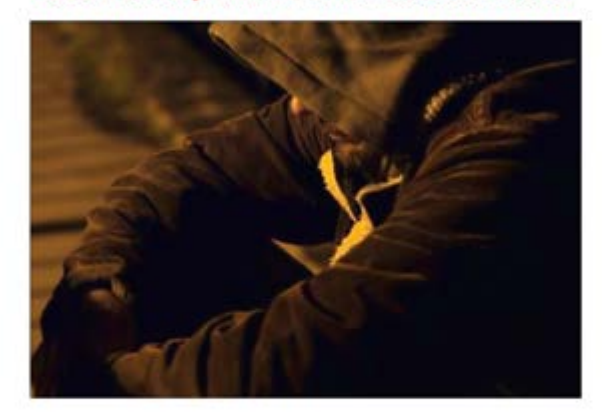
A report commissioned by the Independent Anti-Slavery Commissioner