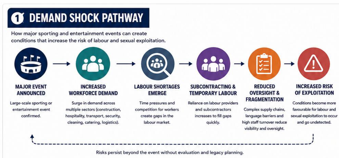
Figure 1: Demand Shock Pathway

Emerging evidence from preparations for the 2026 FIFA World Cup illustrates how these dynamics may operate in practice. Analysis conducted by STOP THE TRAFFIK across host cities in the United States and Canada has identified increasing volumes of online advertisements associated with commercial sex markets, alongside changes in language and service offerings that may indicate adaptation by exploitative actors in anticipation of heightened demand. 3 While such findings do not demonstrate a direct increase in trafficking prevalence, they provide a contemporary example of how major events can create conditions that increase opportunities for exploitation and make detection more difficult.