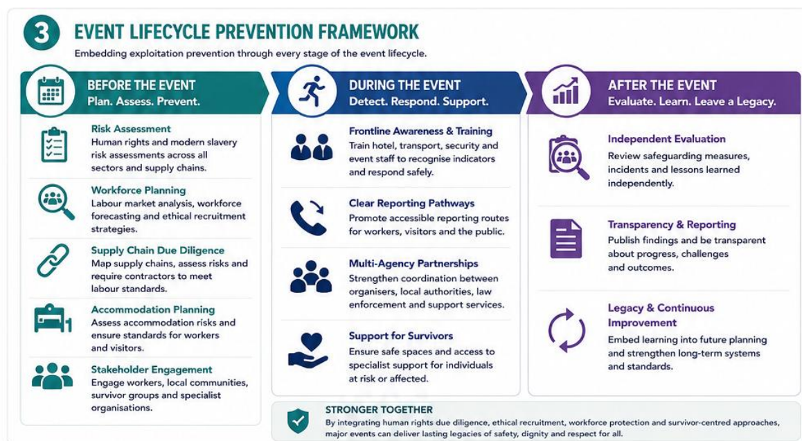
Figure 3: IASC Example of Preventative Framework

The challenge for future hosts is not simply to respond to exploitation when it occurs, but to anticipate risks before they emerge. By embedding human rights due diligence, ethical recruitment and survivor-informed safeguarding throughout the lifecycle of an event, organisers, governments and businesses can reduce vulnerabilities and create a lasting legacy of prevention.